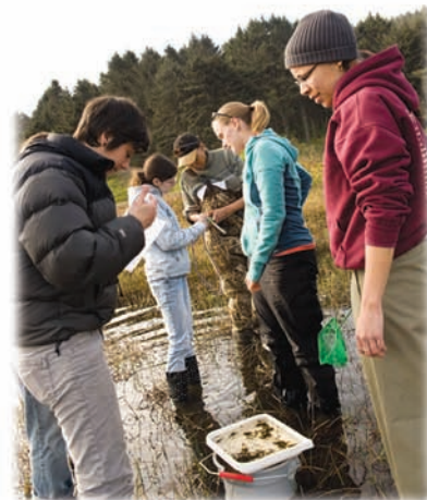
Humboldt State University

October 18-20, 2012 • Baltimore, Maryland Diversity, Learning, and Inclusive Excellence