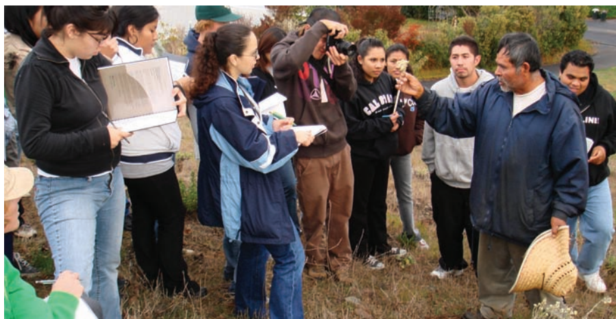
California State University San Marcos

A body of scholarship has identified a statistical link between specific learning practices and increased retention, persistence, and graduation rates, as well as increased achievement of some key learning outcomes. 1 These classroom experiences, or high-impact practices, typically combine components of out-of-classroom learning with high levels of interaction among students, faculty, and peers. Such experi-