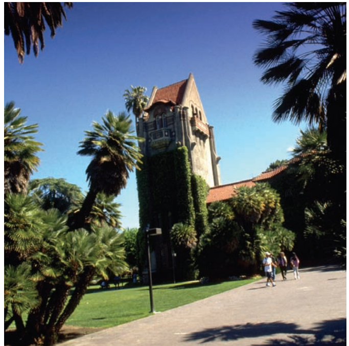
San José State University

The pilot sections were introduced at EVC, but they were held at SJSU beginning in the fourth week of the semester. In addition to the usual assignments, students exchanged letters with sixth-graders at a low-performing school through a “Writing Partners” service-learning program.