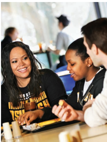
University of Wisconsin-Oshkosh

Publicizing the specific institutional activities that directly contribute to the persistence of first-generation college students has helped to preserve and expand SOU's most effective practices.