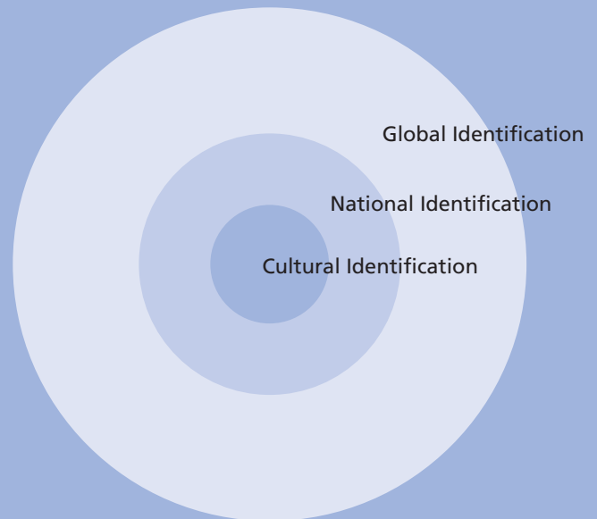
FIGURE 2: CULTURAL, NATIONAL, AND GLOBAL IDENTIFICATIONS

A major goal of multicultural citizenship education should be to help students acquire a delicate balance of cultural, national, and global identifications.