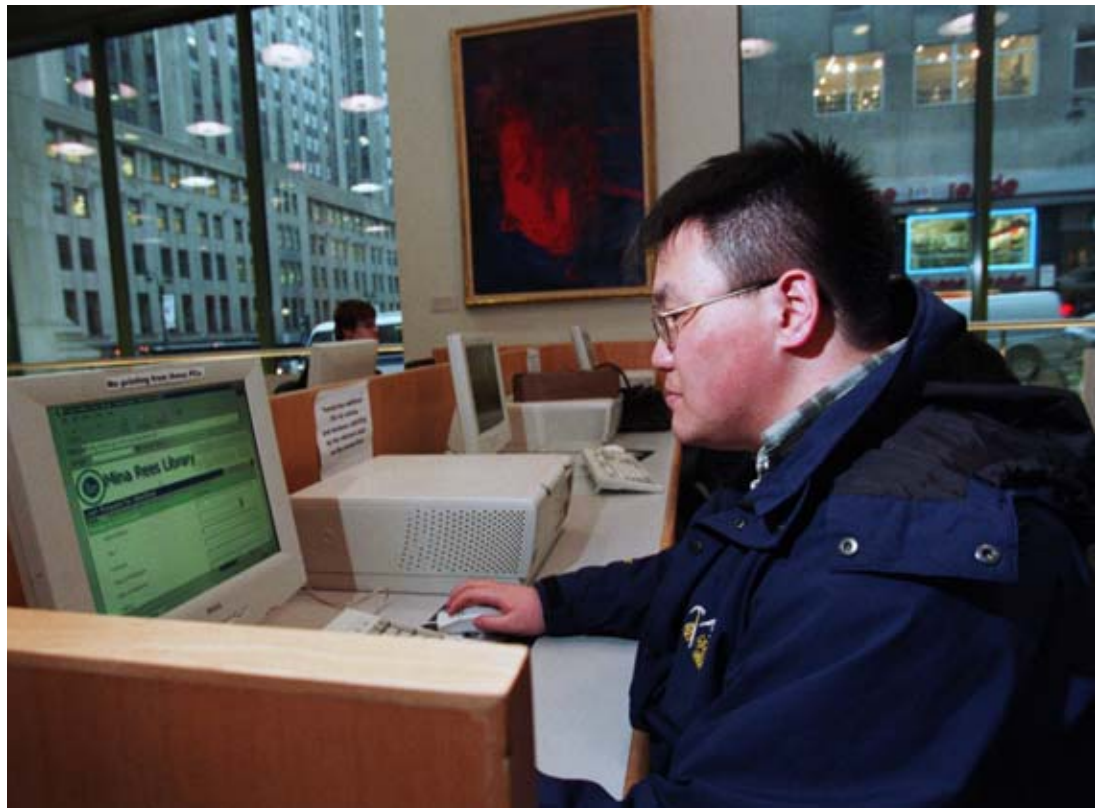
Graduate Center of the City University of New York

Underlying these conflicts is the fact that in the private academic sector boards of trustees and top administrators have absolute control of the budget. But there is another factor influencing the decline of faculty governance: so-called executive pay plans set middle and top administrators’ pay and perks at levels significantly above those of faculty, creating an unbridgeable gulf between faculty and administration. Although it is still true that most institutions recruit their top and middle administrators from the ranks of faculty, once in positions such as dean, provost, and president, few top administrators return to the ranks of the professoriate after their term(s) of office. Instead, when their term is over, in preference to resuming their duties as a professor they enter the executive job market and trust their futures to headhunting firms. Administration becomes for most, if not all, a career that