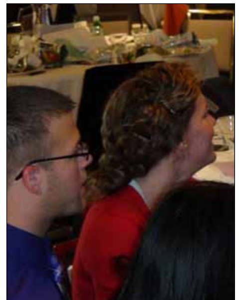
Students listen to debate discussion.