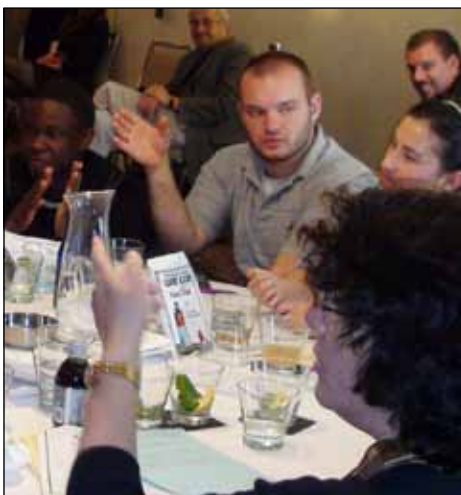
Students at conference discussing the 4R's.

When I am in my office working until midnight or eating my meals as I simultaneously revise proposals and initiatives, I often reflect on what I may be missing. Am I sacrificing my grades, am I losing friends, or am I missing out on ‘typical’ college experiences? Ultimately, I have realized that sacrifice is a necessary risk to create a meaningful and lasting impact on communities...as